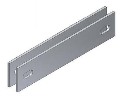
USED TO CONNECT MESH PANELS TO EACH OTHER BETWEEN LINE POSTS

1 each 5/8" x 2" guard rail bolt required for each clamp. Nuts and bolts are not included